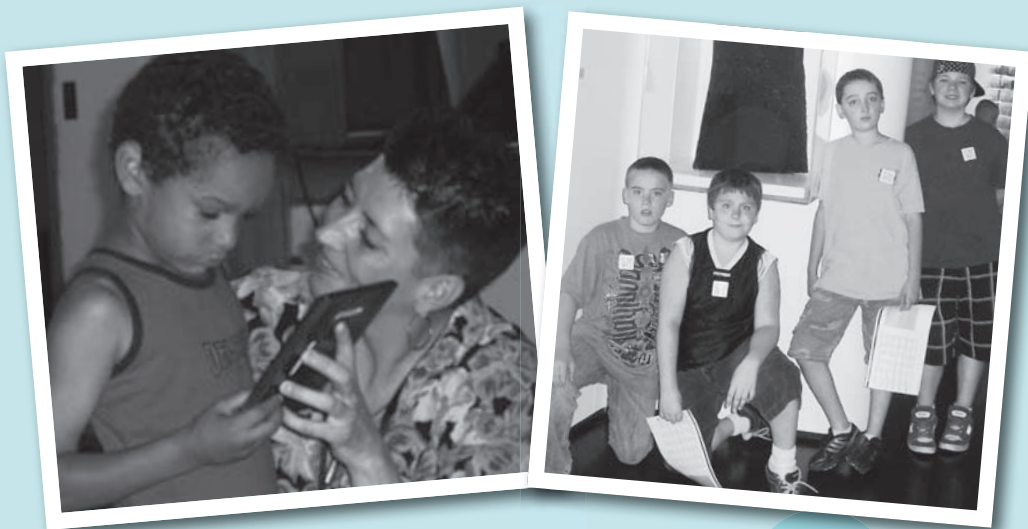
Your donations and gifts help us to provide creative programming for kids! (Photos: Awards Ceremony and Field Trip for Day Treatment Program.)

Donating IRA assets can be a rewarding strategy for both you and the charity. AS ALWAYS, you should talk with your financial representative or tax advisor before making a decision that alters your tax situation. It is important to consider your tax situation before deciding whether to make a charitable contribution from your IRA.